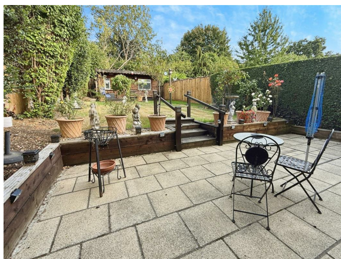
CABIN / WORKSHOP 20'0" x 12'2" (6.11 x 3.71)